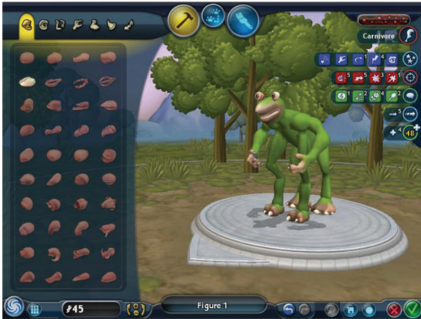
FIG. 1.—Screenshot of Creature Design. Above is a sample screenshot of the Creature Creator module of the computer game Spore . The left side of the screen displays various body parts that can be added to the creature. The upper-right corner of the screen displays various measures of the creature’s abilities. The second row of boxes on the upper right displays the four attack-ability measures: bite (level = 5), charge (level = 5), spit (level = 3), and strike (level = 1). The third row of boxes displays the four social-ability measures: sing (level = 1), dance (level = 2), charm (level = 4), and pose (level = 2). During the experiment, these measures were constantly available and adjusted real-time as participants added and removed parts from their creatures. “DNA points,” used as currency to purchase parts, are displayed in the bottom-left corner of the screen (currently DNA = 45). Buttons at the top center of screen allow participants to paint their creature and see their creature move in a simple environment.

domination. To calculate this compensation, a research assistant placed each participant’s creature in a Spore environment after the experiment had ended, and gave it commands to either attack or socialize with neighboring creatures (depending on the implemented strategy). The research assistant was not aware of the experimental conditions or the purpose of the study. The time to dominate (either by overpowering or by befriending) two computer-based creatures was recorded. On average, the higher a creature’s total attack (socialize) ability level (i.e., the sum of the four attack (socialize) ability levels), the faster the creature dominates other creatures.